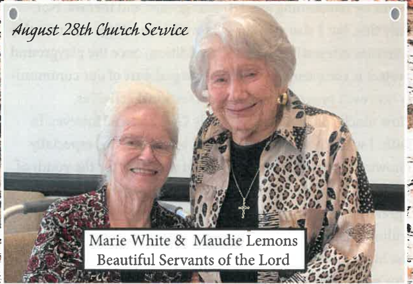
August 28th Church Service