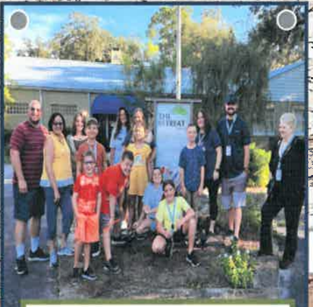
YOUTH FAMILY CAMP