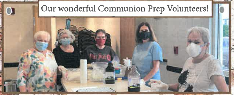
Our wonderful Communion Prep Volunteers!