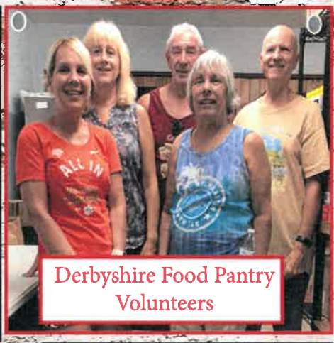
Derbyshire Food Pantry Volunteers