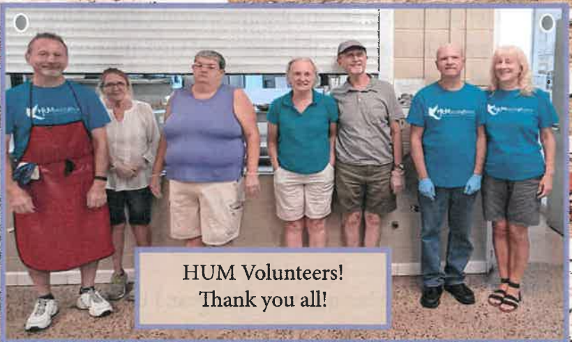
HUM Volunteers! Thank you all!