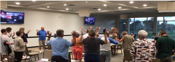
Closing our Board Meeting with Prayer July 2021

Everyone has a story to tell. What's yours? How has the Drive In Church impacted your life?