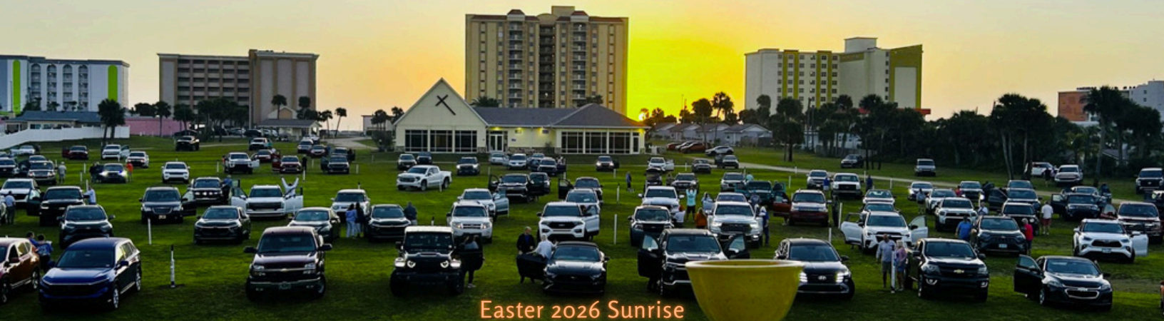
Easter 2026 Sunrise

Men's Prayer Breakfast 2nd Tuesday of the month 7:30am